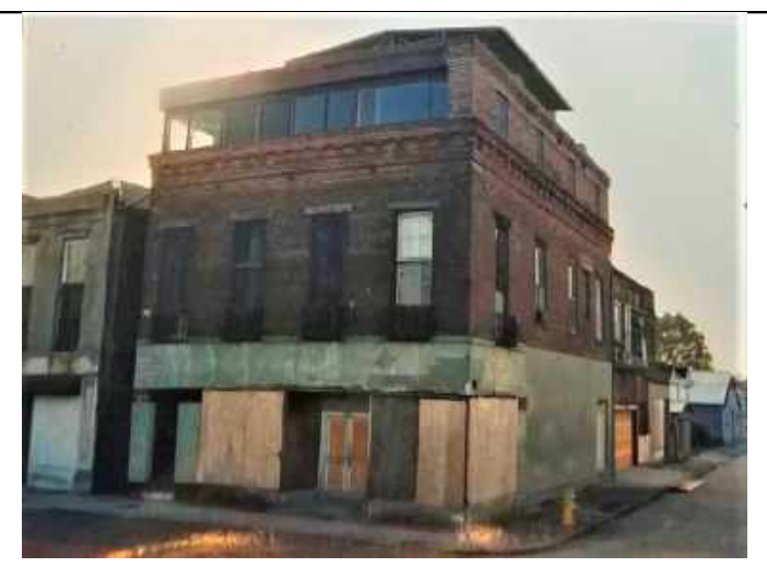
Nat B. Knight's penthouse on Front Street at Newton.

On the next block between Newton and Huey P. Long Avenue, most of the original buildings still exist. The first building in the 700 block, at the