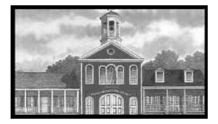
Gretna Historical Society Museum Complex

201-209 Lafayette Street P.O. Box 115 Gretna, LA 70054-0115