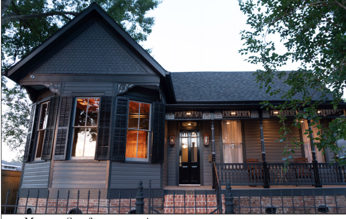
700 Monroe St. after restoration