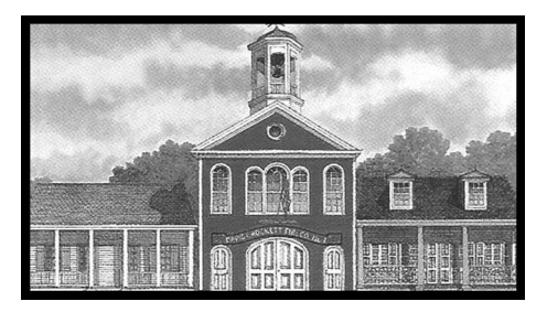
Gretna Historical Society Museum Complex

201-209 Lafayette Street P.O. Box 115 Gretna, LA 70054-0115