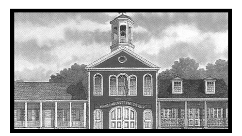
Gretna Historical Society Museum Complex

201-209 Lafayette Street P.O. Box 115 Gretna, LA 70054-0115