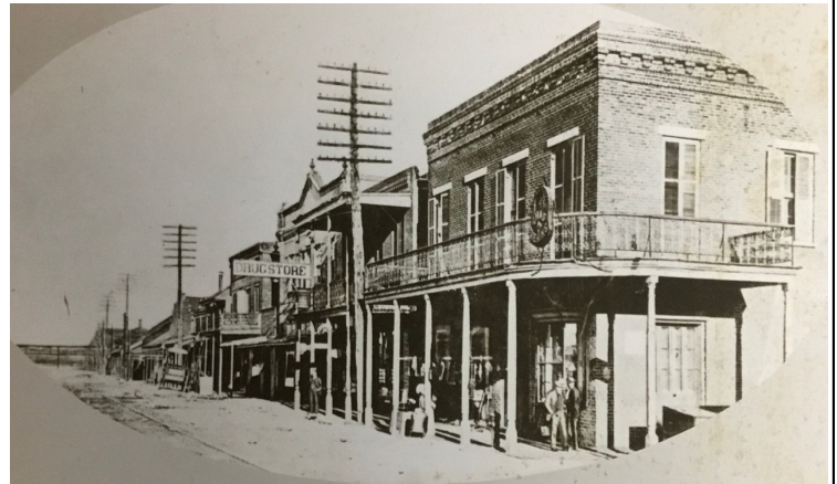
Gretna’s Front Street, 1900.

Alvin Stumpf added new insecticides and sanitary supplies to the original stock of ant poisons. Other products manufactured on site were roach powder and paste, deodorizing blocks, Rust-A-Way, Moth Eater, and Death-Ray mosquito spray, which came in a refillable