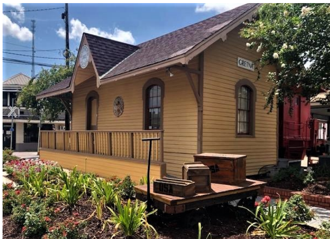
The renovated Depot.

Stay tuned for the latest news from the GHS!