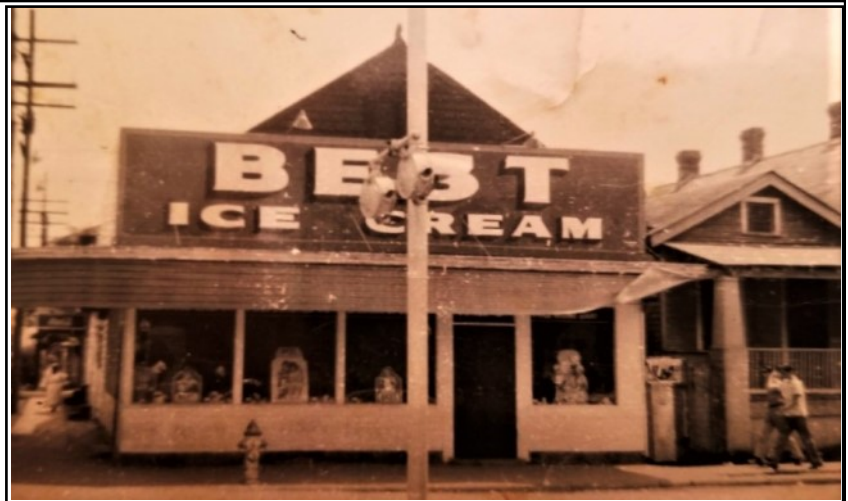
Best Ice Cream once occupied the corner where Roulé Ice Cream is today.

The building now housing Huey P’s Pizzeria is probably the oldest building on the block. The turn of the century building was previously Cut Rate Drug Store, the Gretna Pharmacy of Richard and Vicknair, and the law offices of