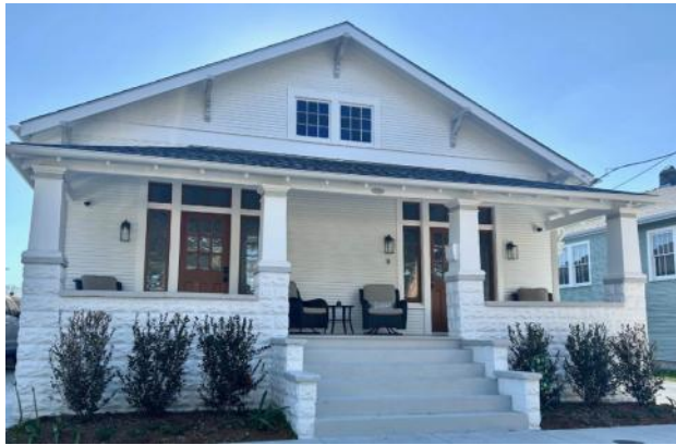
Another Huey P. Long Avenue home on the tour.