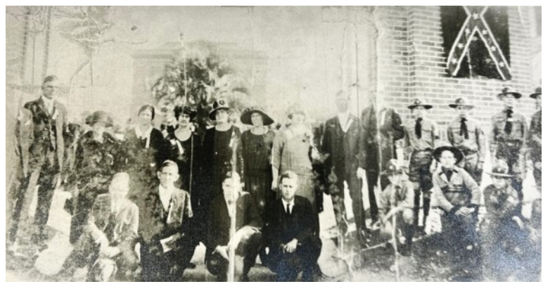
This historic photo shows the dedication ceremony of Gretna's Jefferson Memorial Arch on November 11, 1923.

The dedication of the Arch was Armistice Day, Nov. 11, 1923. Armistice Day commemorated the signing of the armistice on Nov. 11, 1918 to end fighting between the Allied Forces and Germany during WWI. To honor all veterans, the first Veterans Day was celebrated in 1947. Armistice Day was officially changed to Veterans Day in 1954.