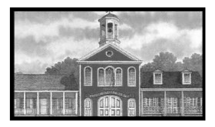
Gretna Historical Society Museum Complex

201-209 Lafayette Street P.O. Box 115 Gretna, LA 70054-0115