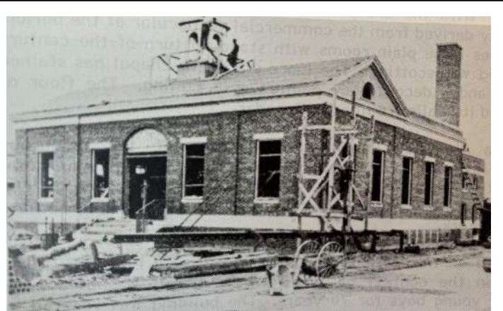
Construction in 1937 of the old post office, now the Cultural Center for the Arts.

When Gretna became a city in 1913, Alvin T. Stumpf started a drive to build a better post office