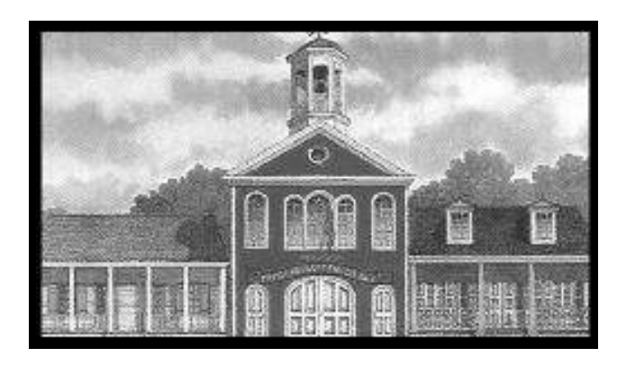
Gretna Historical Society Museum Complex

201-209 Lafayette Street P.O. Box 115 Gretna, LA 70054-0115