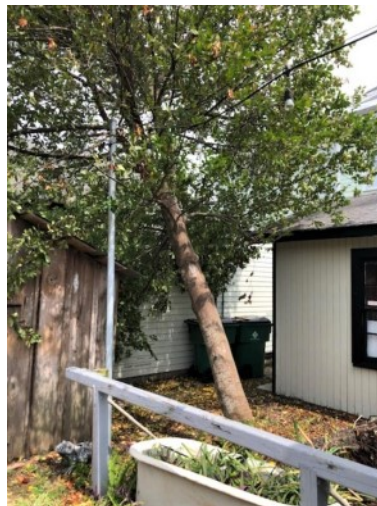
Hurricane Ida blew down one tree and did minor window damage at the Museum Complex.