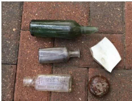
The uprooted tree exposed these old “treasures.”