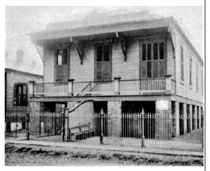
McDonogh #27 School.

The first high school in present day Jefferson Parish was McDonogh #33, known as McDonogh Jefferson High School. This joint venture of Jefferson Parish and the McDonogh Commission was located at First Street and Ocean Avenue. The circa 1907 two story basement building held 12 rooms with a capacity of 300 students. It closed when Gretna High School opened in 1928. The building was used as a trade school afterwards but demolished in 1974, after being badly damaged by Hurricane Betsy in 1965.