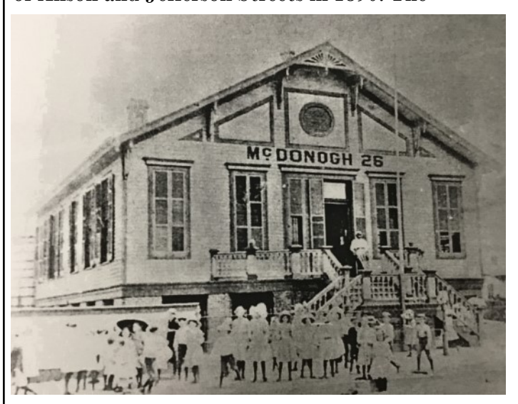
The original location of McDonogh #26 School.

The first McDonogh funded school in Jefferson Parish was erected in McDonoghville on the corner of Anson and Jefferson Streets in 1890. The